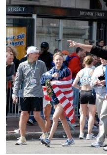
Photo of Deena Kastor winning the 2008 Olympic Trials - Women's Marathon

You are receiving this E-Newsletter because you have signed up for a Jack's Fund Event in the past. If you wish to unsubscribe to this E-Newsletter, please respond to this email with the word 'UNSUBSCRIBE' in the subject field.